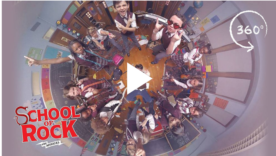
SCHOOL OF ROCK: The Musical – "You're in the Band" (360 Video)

Virtual reality takes the 360-degree video experience a step further by adding depth. When viewed with a VR headset—not far from those red View-Masters you might have used as a kid—images become three-dimensional, which adds to the feeling of immersiveness. On top of that, spatial audio lets people listen to audio from all directions, just as in the real world.