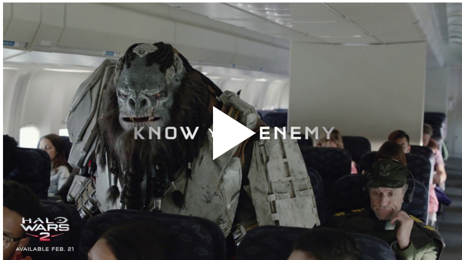
Know Your Enemy: Halo Wars 2